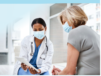
* https://www.cdc.gov/mmwr/volumes/69/ wr/mm6936a4.htm

Don't have a primary care doctor? Start here: CHIhealth.com/Clinic